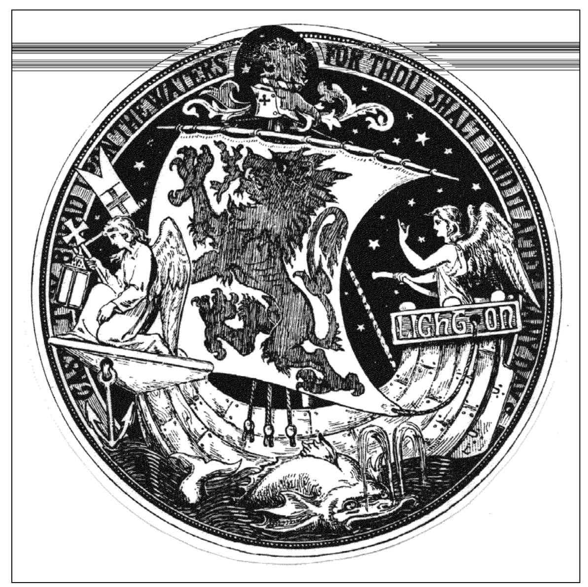
by Wallace D. Wattles